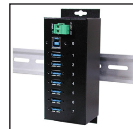
Din Rail Mounting